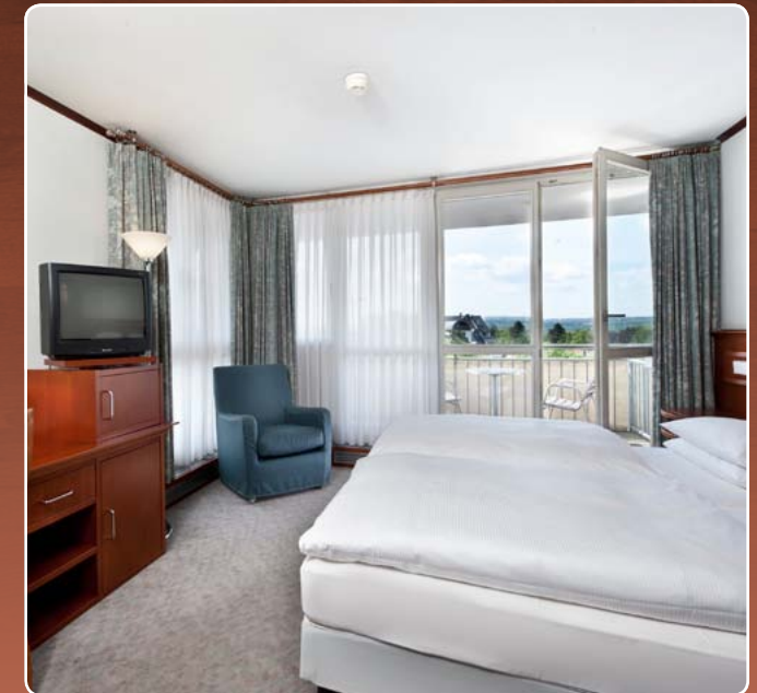
Studio Standard 24m 2 / max. 2 Personen