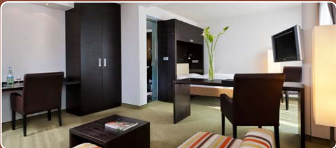
Apartment 39 m² / max. 4 adults